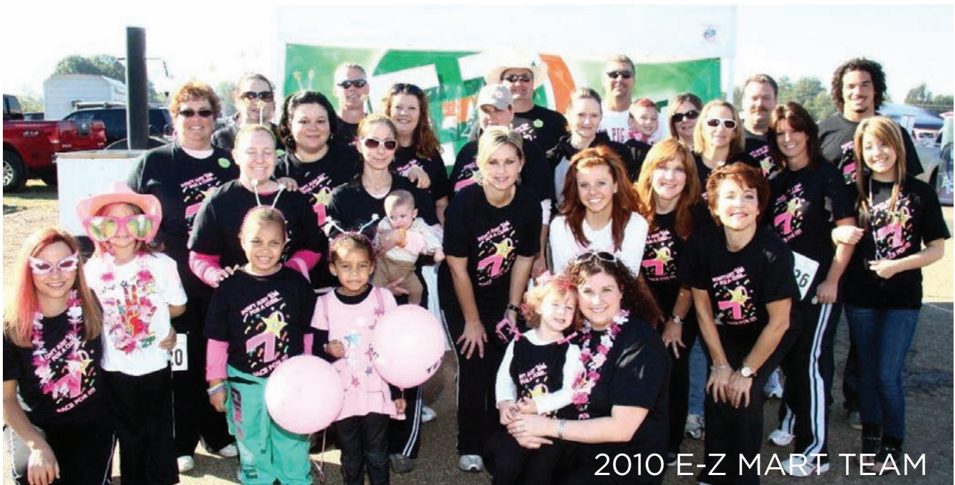
2010 E-Z MART TEAM

E-Z MART supports the Komen Texarkana Race for the Cure and proudly serves as the Grand Presenting Sponsor for the 12th year. Our company and employees are passionate about saving lives and ending breast cancer forever.